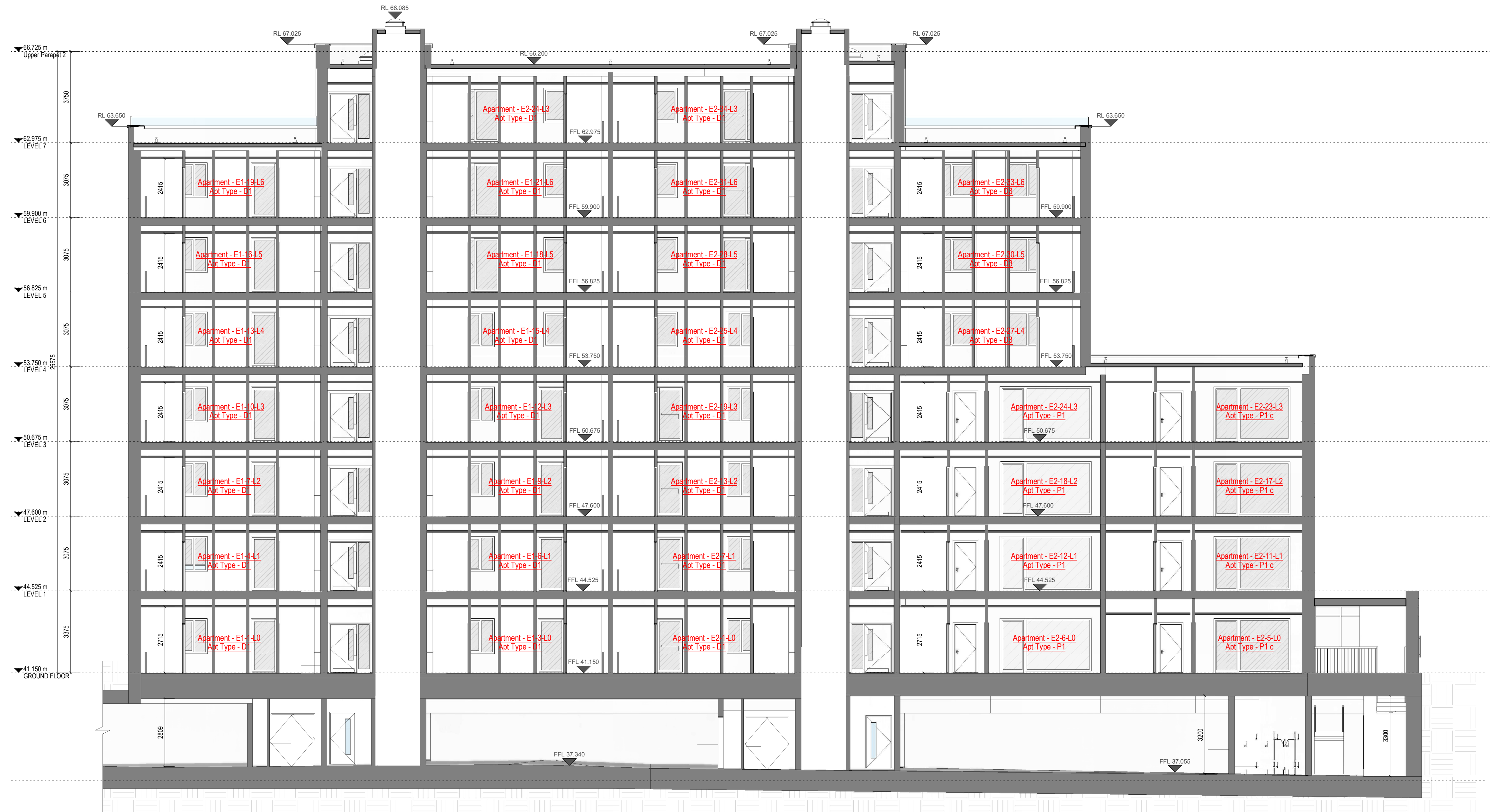
1 GA - Section AA 1 : 100